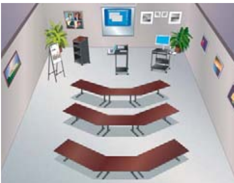
Room Layout 2 - Auditorium style training room for up to 18 people.