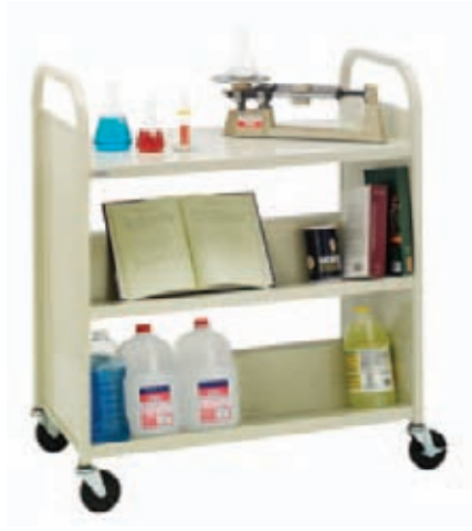
FV336 Duro Combo Book Truck

Two double-sided slanted shelves on top and flat shelf on the bottom, with 4" quiet glide heavy duty casters. Ships assembled, except for the casters.