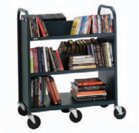
SWVF336 Mammoth Combo 6 Wheel Book Truck

Top flat shelf and two double-sided slanted shelves on the bottom with 4" quiet glide heavy duty casters. Ships assembled, except for the casters.