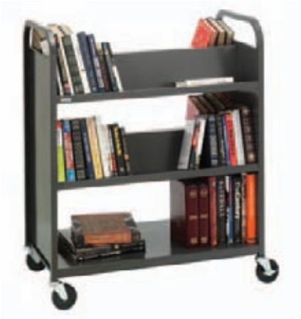
VF336 Duro Combo Book Truck

Two double-sided slanted shelves on top and flat shelf on the bottom, with 4" quiet glide heavy duty casters. Ships assembled, except for the casters.