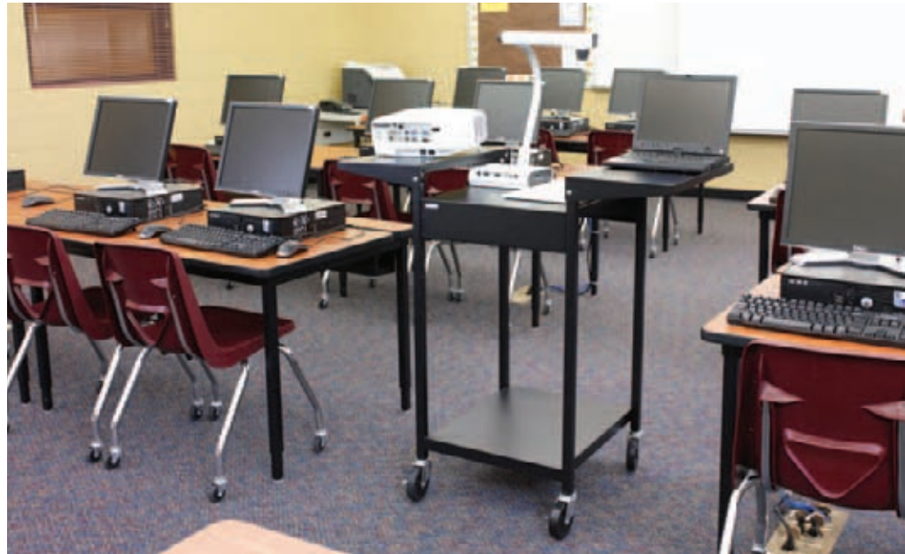
OH39 Projector Cart

For stand-up presentations. Cart is 39" H for standing use. Projector well adjusts from 29"-37 3/4 " H (in four increments). Includes folding drop leaves on both sides of projector well.