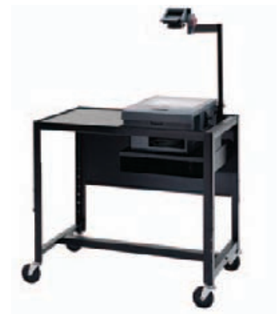
AOH2741 Projector Table

See pages 192-195 for special order colors. Additional costs and longer lead times may apply.