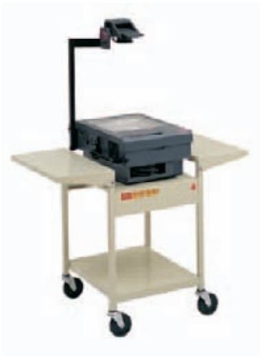
OH29 Sit-Down Projector Table

★ Holds presentation materials ideal for classrooms, labs, conference rooms, and lecture halls.