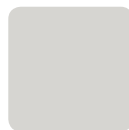
Grey Mist (-GM)

See pages 192-195 for special order colors. Additional costs and longer lead times may apply.