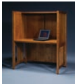
CARRELS Carrels can be outfitted with a flip-up power and data grommet as well as with a task light.