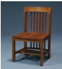
ARMLESS READING CHAIR Reading chairs are available with and without arms.