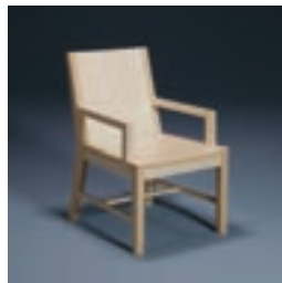
ARM READING CHAIR Reading chairs are available with and without arms as well as with four legs or a two-position base.