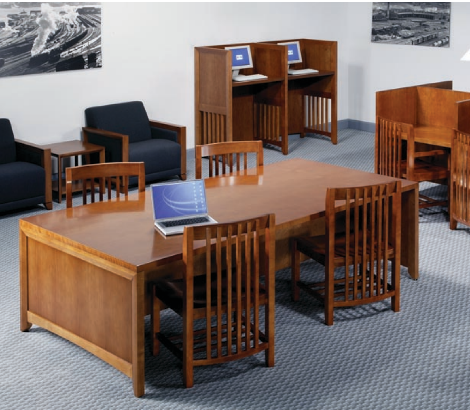
ELMHURST TABLE AND CHAIRS / STUDY DESK WITH LIGHTING AND CHAIRS / KIOSK STARTER AND ADD ON / LOUNGE CHAIRS AND SIDE TABLE

Elmhurst. Quality and dedication to the craft of fine furniture making are the first impressions of the Elmhurst collection. Strict attention to detail is apparent in this design. Elmhurst's architectural influence can be seen in the design allowing it to adapt to both traditional and contemporary settings.