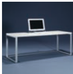
WORKSTATIONS Workstations provide "in-library" computer labs.