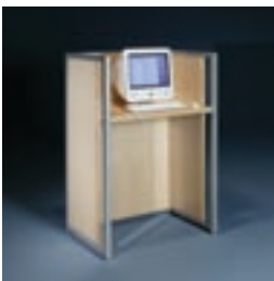
KIOSKS Kiosks are perfect walk-up stations for easy patron access.

Ithaca. The Ithaca collection can be defined as quiet, composed and orderly. This clean-lined design is sophisticated yet unadorned with a simple elegance and a sense of purpose. Ithaca's design allows for the opportunity to place this furniture almost in any setting.