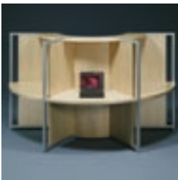
60 DEGREE RADIUS CARREL Create unique study or computer areas by ganging three or six 60 Degree Radius Carrels together.