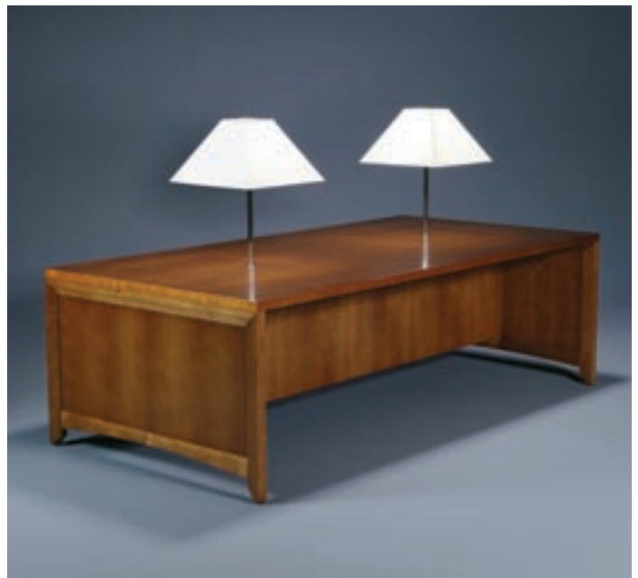
READING TABLE WITH LIGHTING