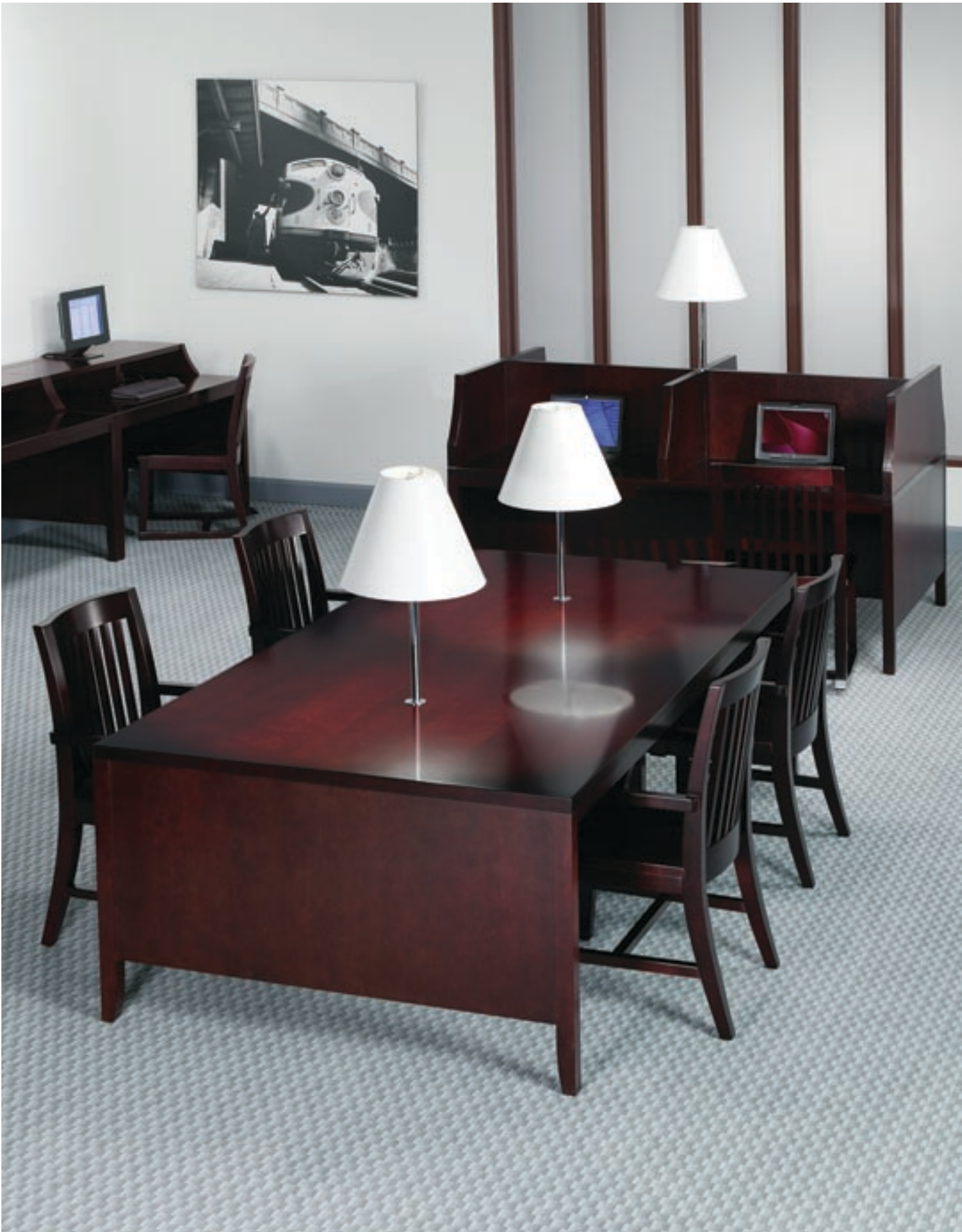
TRINITY HALL TABLE WITH LIGHTING AND CHAIRS / STUDY DESK WITH LIGHTING / COMPUTER DESK