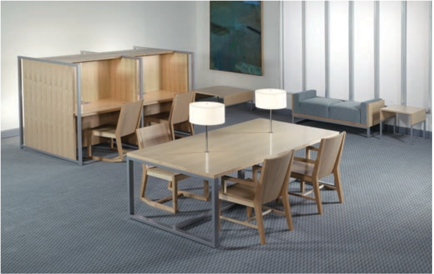
ITHACA TABLE AND CHAIRS / DOUBLE-FACED CARREL FOUR-PACK AND TWO-POSITION CHAIRS / DOUBLE BENCH / COFFEE TABLE

Ithaca. The Ithaca collection can be defined as quiet, composed and orderly. This clean-lined design is sophisticated yet unadorned with a simple elegance and a sense of purpose. Ithaca's design allows for the opportunity to place this furniture almost in any setting.