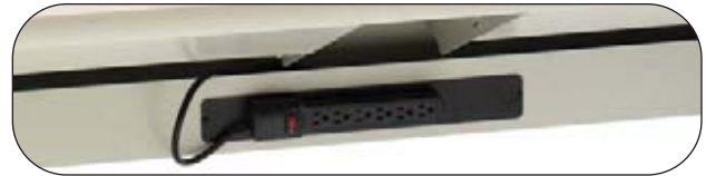
ECF6 Power Strip

All Connections series tables are made at one of Bretford's Chicago area manufacturing facilities using union labor.