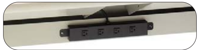
Juice Power System