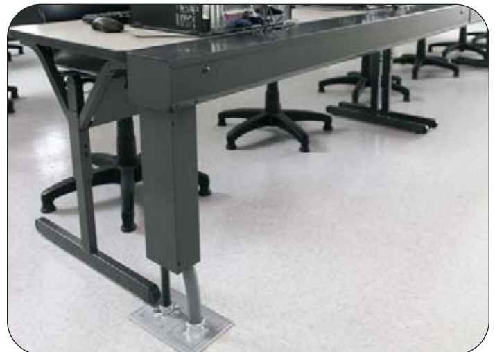
PowerBar Hardwired System