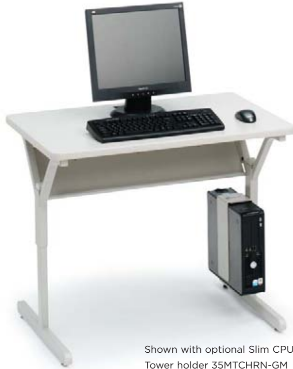
Shown with optional Slim CPU Tower holder 35MTCHRN-GM