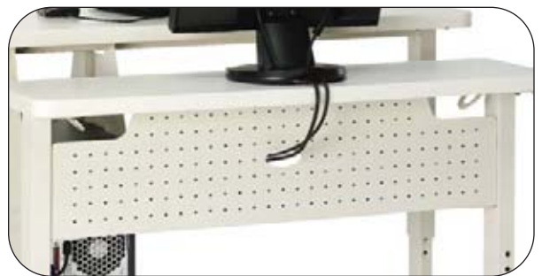
Easy cord management keeps things neat.