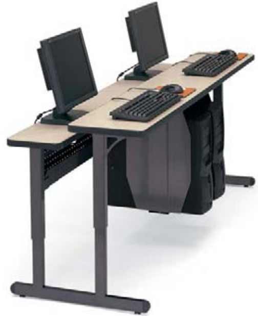
Shown in premium finish options

All Connections series tables are made at one of Bretford's Chicago area manufacturing facilities using union labor.