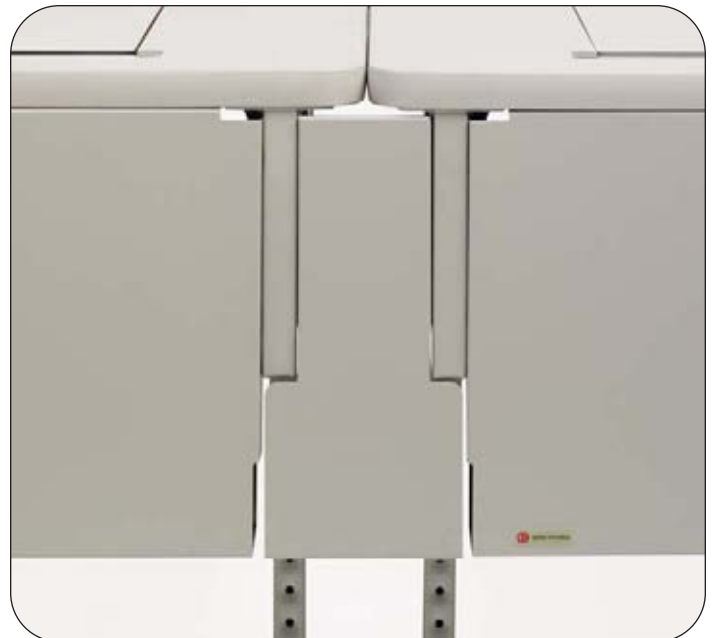
SmartDeck Cord Bin Bridge

35SD21, 35SD21MT, 35SD27, 35SD27MT, 35SD25 & 35SD25MT are height adjustable from 24-32" in 1" increments. The width is 36"w, 66"w or 72"w depending on the model. Table top is constructed from 1" thick 45 lb. density furniture board grade substrate, covered with high pressure .05" (0.1cm) laminate and 3mm TPE T-mold trim. The modesty panel/cord management bin is made from 18-gauge steel and runs the width of the table. Legs are constructed from 18- and 14-gauge steel tubing. The CPU Harness is constructed from steel and mounts on the leg. 36"w model comes with one CPU Harness and the 66"w and 72"w model comes with two. Standard CPU harness adjusts 6"-11-1/2"w and slim CPU harness (MT models) adjusts 3 1/2"-5-7/8"w. All steel parts are constructed with "prime" steel which has a 25% to 35% post-consumer recycled content and are finished in environmentally friendly powder paint. Table are GREENGUARD INDOOR AIR QUALITY CERTIFIED®. Ship ready to assemble.