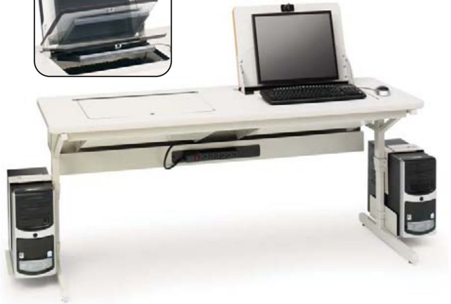
35SD27-GMQ with ECF6 Softwired Electrical Unit