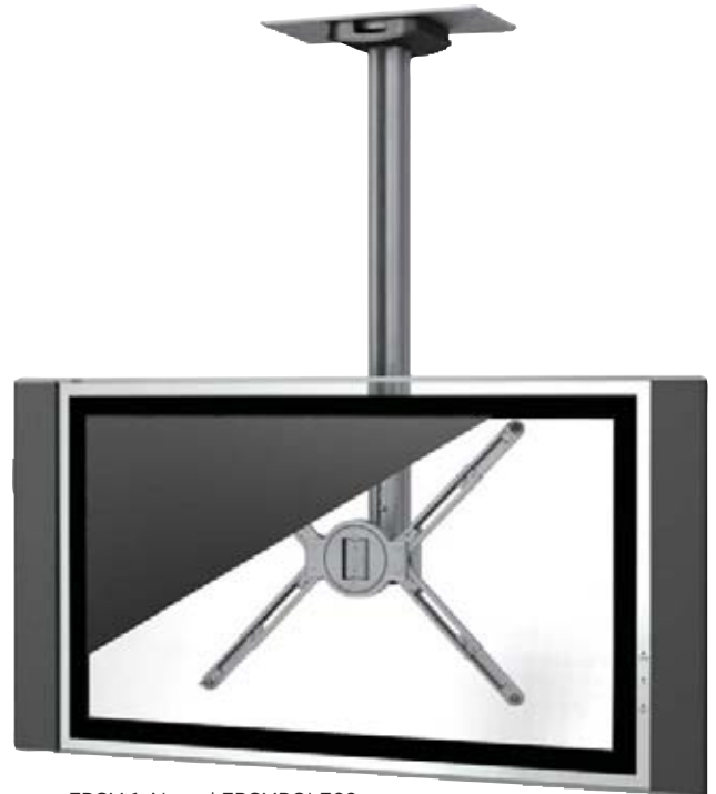
FPCM-1-AL and FPCMPOLE60

NOTE: Always use a professional installer when mounting TV monitors. Warranties and UL listings are void when improperly installed.