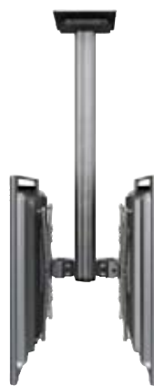
FPCM-2-AL and FPCMPOLE60