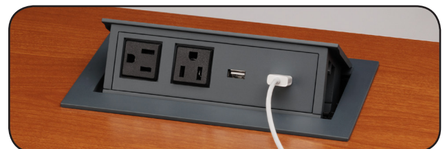
Fluid Up is also available with USB power outlets instead of data