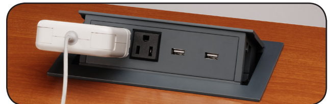
The outer electrical plug is turned 45° to accommodate plugs with large adapters, DPAUSB shown

Components of the Fluid Power System are manufactured for Bretford in the USA.