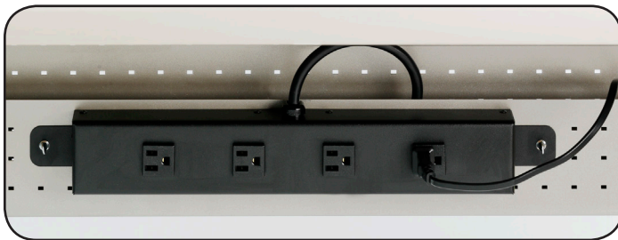
Fluid Down 4-outlet electrical unit

The Fluid Up power system is keyed the same as Fluid Down and may be used together on a table to provide power above and below the work surface. Use of Fluid Up (DPA2) and Fluid Down (DPCF4) together reduces the number of tables that can be used together, no more than two Up and two Down units should be used with a single Power In-Feed, or 12-outlets total.