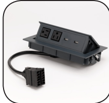
Pop Up Power Unit