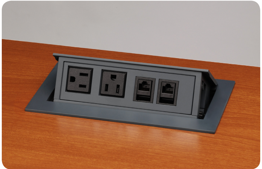
Shown with two RJ-45 data jacks installed, data not included.