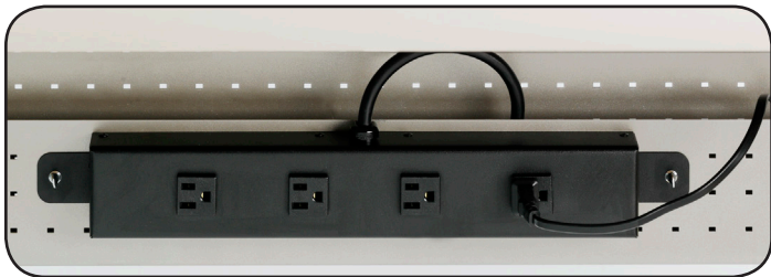
Fluid Down 4-outlet electrical unit

The Fluid Up power system is keyed the same as Fluid Down and may be used together on a table to provide power above and below the work surface. Use of Fluid Up (DPAUSB) and Fluid Down (DPCF4) together reduces the number of tables that can be used together, no more than two Up and two Down units should be used with a single Power In-Feed, or 12-outlets total.