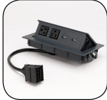
Pop Up Power Unit