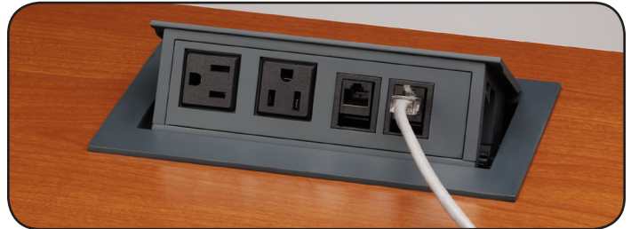
Fluid Up is also available with data ports instead of USB