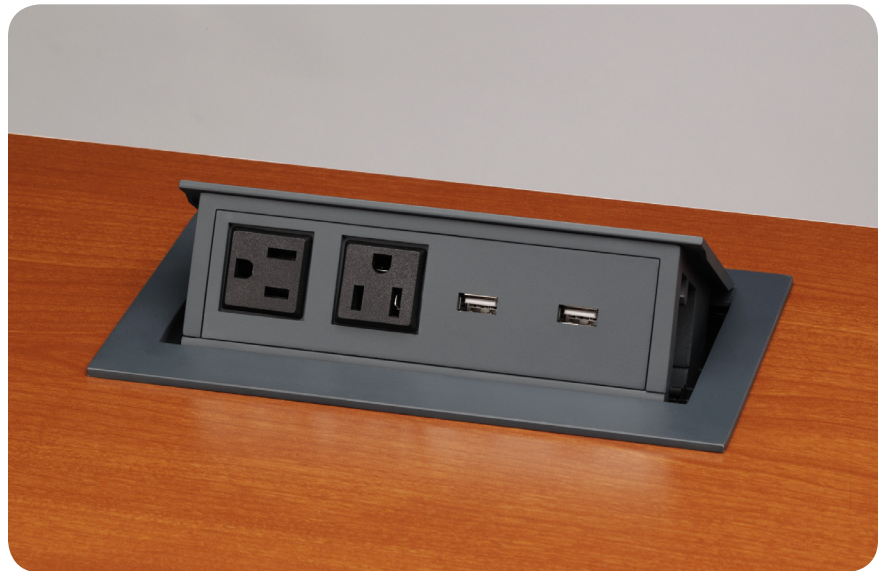
DPAUSB9-P with regular and USB power