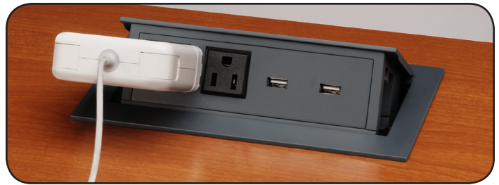
The outer electrical plug is turned 45° to accommodate plugs with large adapters