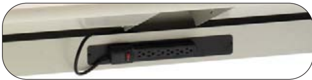
ECF6 Power Strip

ECF6 6-Outlet Power Strip (1 each table)