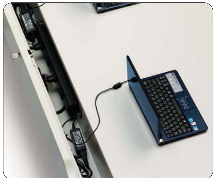
Locking Rear Door For Easy Access And Cord Management