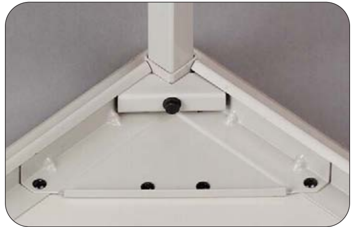
Reinforced Leg Design

Quattro Voltea Computer Tables are height adjustable from 24" to 32" in 1" increments. Available in 24", 30" and 36" depths by 30", 36", 42", 48", 60", 72" and 84" widths depending on the model specified. Laminate table top and cord bin door are made from 1" thick, 45 lb. density particle board and 3mm thick vinyl T-molding. The flip up door includes cut-outs to let power and data cables pass into the cord bin and a lock with two keys. Note that all Quattro Voltea tables use the same key to secure the rear flip up door. Table top incorporates a 14-gauge steel apron around the table edge for maximum strength and durability. Telescoping legs are constructed from 1-1/4" 12-gauge steel and 1" 14-gauge steel tubing and attach to the top using a unique hex/tie bolt assembly. Cord management bin runs the width of the table, is constructed of 18-gauge steel and is secured to the table apron and leg with (2) 10-32 screws. Table is available in a Wild Cherry wood grain laminate with Black T-molding and Black powder paint base or with a Grey Mist laminate with Quartz, Cardinal, Polo or Topaz T-molding and a Grey Mist powder paint base. All steel components are constructed with "prime" steel which features 25% to 35% post-consumer recycled content. Tables are GREENGUARD INDOOR AIR QUALITY CERTIFIED®.