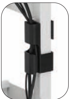
Includes CRDMR Cord Minder Clips

The BB series wide body carts for CRT style monitors are made in Bretford's Chicago area manufacturing facility using union labor.