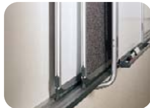
Write-on Dry Erase Wall Covering plus 3 layers of presentation boards provide flexibility and mobility.