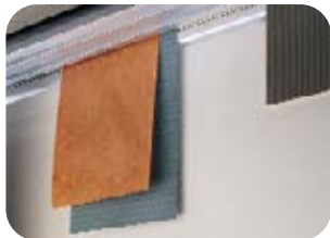
Recesses gravity strip in top rail grips papers for display during presentations.

Inboard is available in a 30" x 40" size or 40" x 40" with porcelain/porcelain or porcelain/tackboard.