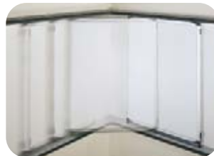
Innovative rail and corners allow boards and screen to roll from wall to wall around 90° corners.