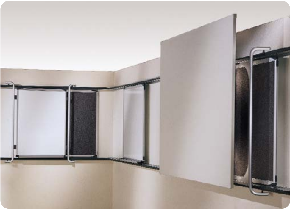
HRD3040 Inboard Porcelain Dry Erase Board / 30" w x 40" h (76 x 102cm). HRD5040 Outboard Porcelain Dry Erase Board / 30" w x 40" h (76 x 102cm). HRS65M Rigid Projection Screen / 72" w x 72" h (183 x 183cm).