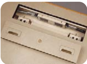
Power access door provides top down access to wire raceway.