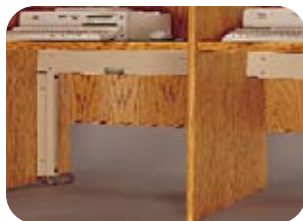
Leg chase brings power and data from the floor to the wire raceway.