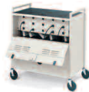
THE BACK OF THE UNIT OPENS FOR EASY ACCESS TO THE ELECTRICAL UNIT.

the breaker you should not exceed 13 amps of usage for an extended period of time,