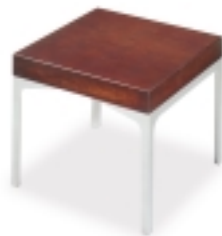
Wood tables have 2 1/2" thick hardwood edges.

The curve of the Long Table allows for plenty of legroom. Frosted Glass is standard, but Clear glass is available upon request.