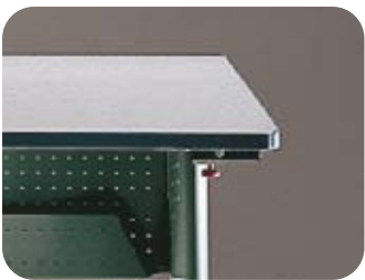
Folding mechanism under the table top conveniently allows the table to fold while remaining in an upright position.