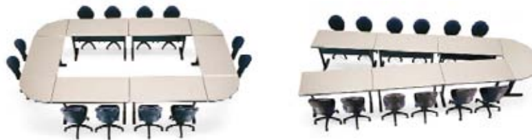
Training tables can be reconfigured into a variety of shapes. The addition of the Vista Table (above right) creates the ideal video conferencing or training setup.