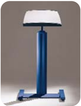
Slim design allows openness with the audience.