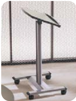
Lectern with 3" casters provides easy and convenient mobility.