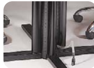
Specified tables have a table top grommet that allows cords to travel through the base to the floor.