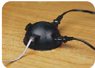
The power and data sphere is within easy reach of the user.

Inside the base is a 4-outlet, surge protected power strip and 4 RJ45 data jacks.