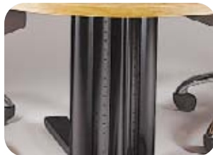
Table bases have four removable panels that provide access to the raceway interior.